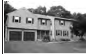
BRISTOL - "Stop Looking" This five bedroom Colonial has a wealth of amenities, three baths, the kitchen with newer granite counters, oak cabinets, newer Harvey windows, air conditioning, gorgeous stone walk ways, in ground pool, gazebo with hot tub, two car garage. $399,900

Call one of our real estate professionals for a market evaluation of your property.