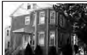
SOUTHINGTON - This three family home, is a wonderful investment property, set on a cul-de-sac in a quiet neighborhood offering large units with hardwood flooring, eat in kitchens, French doors, private porches, assigned parking for tenants. $214,900