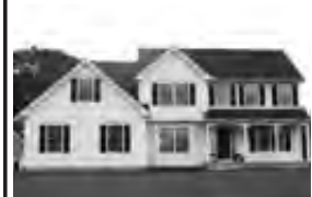
SOUTHINGTON - "Fantastic Price" for this brand new four bedroom Colonial, 1st floor family room with gas fireplace, formal living & dining room, the kitchen with pantry, upper floor laundry and two car garage. $379,900