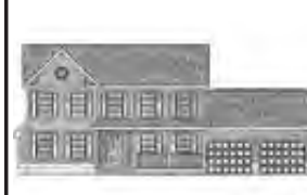
BRISTOL - "Step into a New World" this eight room Colonial to be built with three bedrooms, 2.5 baths, formal living & dining room, family room, two car garage to be completed by March 2010. $299,900